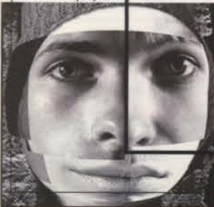
music vs physics

Born of the ever-increasing struggle between sound and science, Music Vs Physics generates music that thrives through the combination of beats and flowing melodies. Kick back with a chemical reaction of cinematic undertones bombarded with slacker beat electrons, fusing the perfect compound of sound.